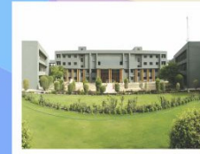
United College of Engineering & Research, Allahabad