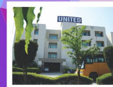
United Institute of Management, Greater Noida