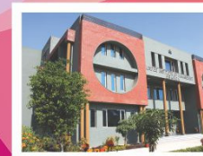
United Institute of Management (FUGS), Allahabad