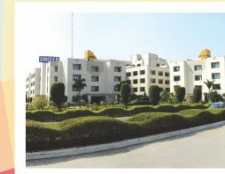
United College of Engineering & Research, Greater Noida