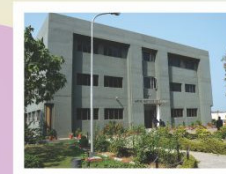
United Institute of Pharmacy, Allahabad