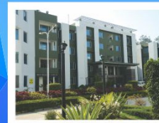
United Institute of Technology, Allahabad