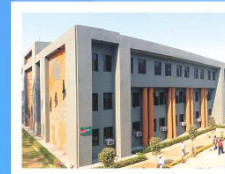
United Institute of Management, Allahabad